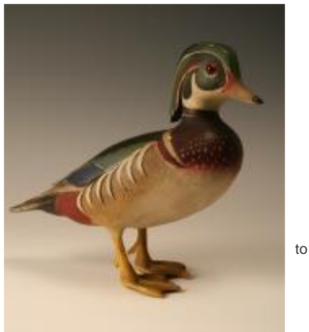
A Ward Brothers Standing Wood Duck Decoy

Most Ward decoys in collections and practically all of their decorative carvings have been signed by one or both of the brothers. These signatures vary in form from a simple printed "L.T. Ward-Bro." and the year carved, presentation messages and occasionally poems.